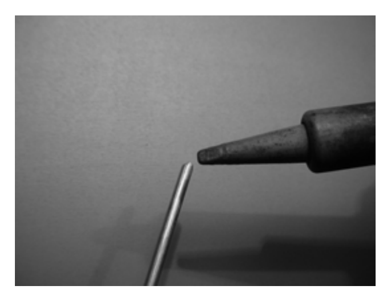
Figure 4.37: Tin the end of the wire before soldering.

5. With the soldering iron, tin the central pin of the connector. Keeping the wire vertical with the pliers, solder its tinned side in the hole of the central pin.