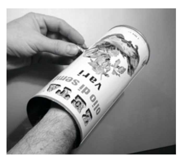
Figure 4.40: Assemble the antenna.

7. Unscrew the nut from the connector, leaving the washer in place. Insert the connector into the hole of the can. Screw the nut on the connector from inside the can.