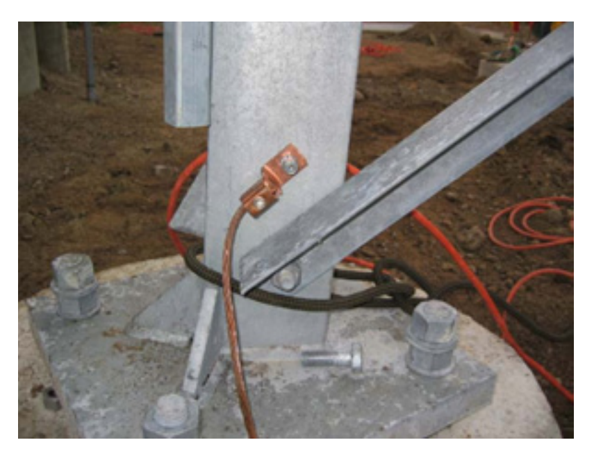
Figure 5.2: A tower with a heavy copper grounding wire.

Lightning is a natural predator of wireless equipment. There are two different ways lightning can strike or damage equipment: direct hits or induction hits. Direct hits happen when lightning actually hits the tower or antenna. Induction hits are caused when lightning strikes near the tower. Imagine a negatively charged lightning bolt. Since like charges repel each other, that bolt will cause the electrons in the cables to move away from the strike, creating current on the lines. This can be much more current than the sensitive radio equipment can handle. Either type of strike will usually destroy unprotected equipment.