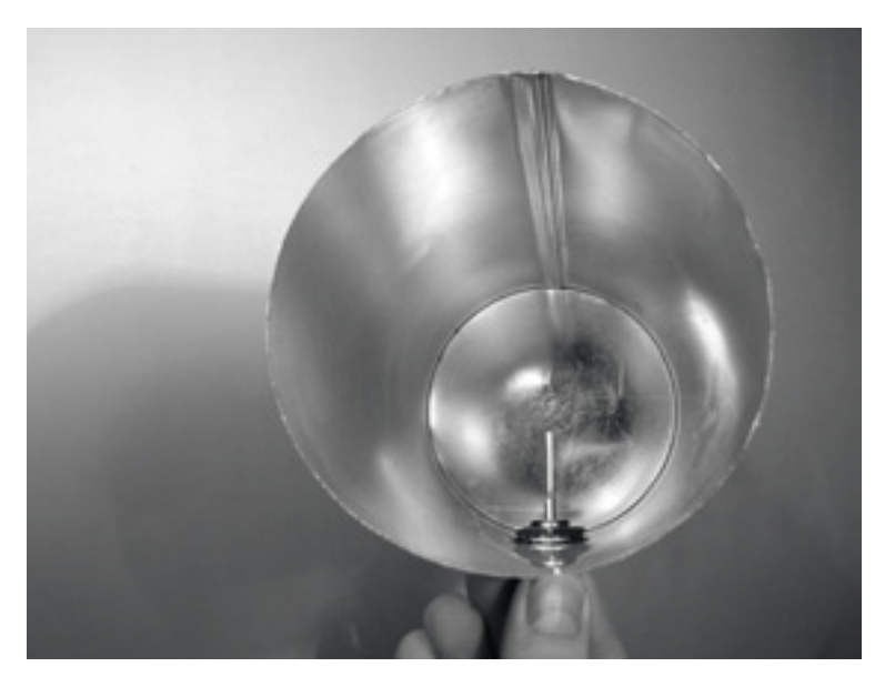
Figure 4.41: Your finished cantenna.

As with the other antenna designs, you should make a weatherproof enclosure for the antenna if you wish to use it outdoors. PVC works well for the can antenna. Insert the entire can in a large PVC tube, and seal the ends with caps and glue. You will need to drill a hole in the side of the tube to accommodate the N connector on the side of the can.