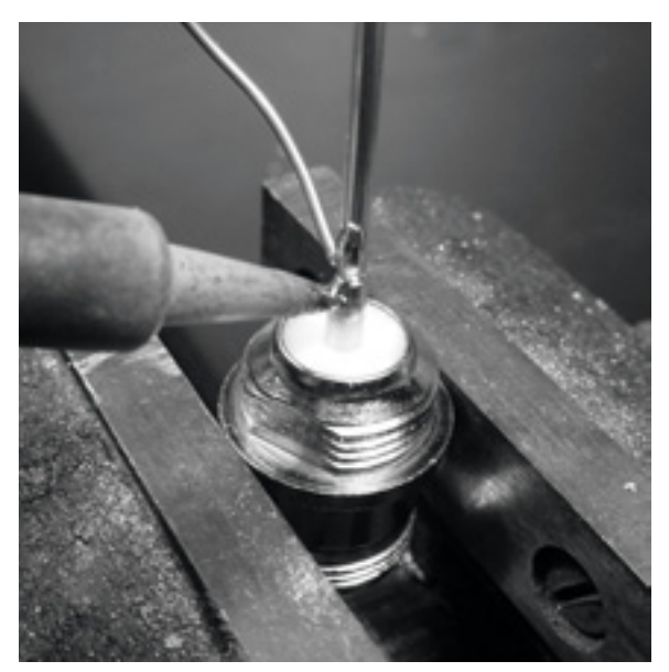
Figure 4.38: Solder the wire to the gold cup on the N connector.

5. With the soldering iron, tin the central pin of the connector. Keeping the wire vertical with the pliers, solder its tinned side in the hole of the central pin.