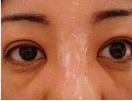
Fig. 3. Patient 2: Before treatment.