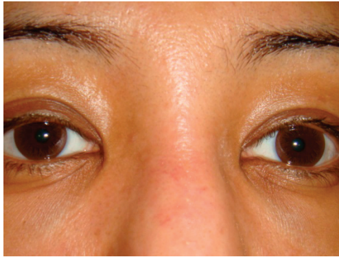
Fig. 5. Patient 2: one year after treatment.

All patients were highly satisfied by the results. Those who developed complications were less satisfied initially, but that improved gradually with time.